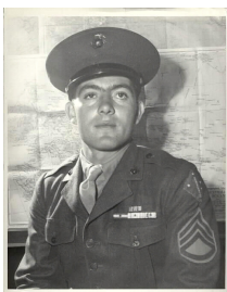
Sgt. John Basilone